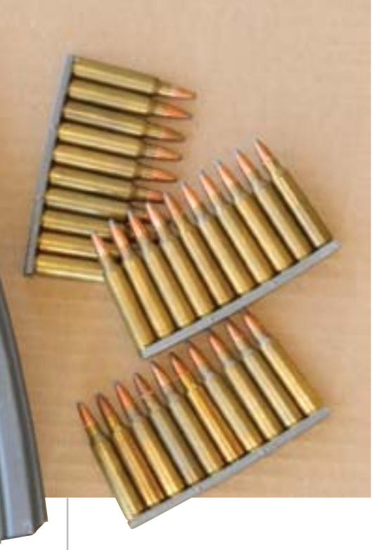
SureFire Mag5-60 was also evaluated while testing Excalibur.

I took 15 different loads from five different manufacturers to the range for evaluation. The bullets ranged in weight from 50 to 77 grains and included both .223 Remington and 5.56mm NATO loads.