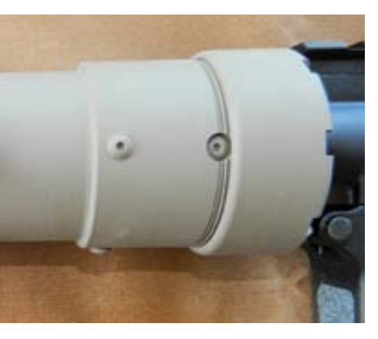
Handguard on Excalibur is Precision Reflex carbon-fiber free-float handguard tube (same as used on SLR15's Grail rifle).

In all honesty, I doubt I would use the Mag5-60 in a carbine course, since one benefit of a class is manipulating the carbine, including loading and unloading. The SureFire mags put one in mind of what Confederate troops said about the Henry Rifle when it was introduced: "That damned Yankee rifle that they load on Sunday and shoot all week!"